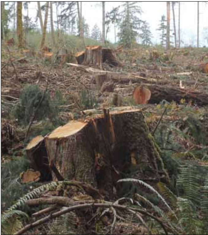
A recent industrial clear-cut near Nanoose Bay.

Less than an hour from Victoria stands a grove of old-growth Douglas-fir and western hemlock on the Koksilah River. The giant trees tower skyward above massive sword ferns, salal thickets, and deep blankets of moss. And amongst the rich flora of this stunning ancient forest grows environmentalism itself. From the loggers who came across the grove in the 1980s and refused to cut the giants, to local grassroots activists who've fought for them on an ongoing basis for decades, this special place stirs our emotions and demands a kind of loyalty from all who visit. People leave the grove proud that a forest like this still exists so close to urban areas, and with a great desire to see it protected.