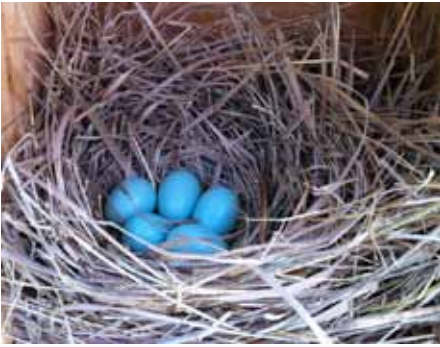
June 27, 2012: Five eggs have been produced by one of the re-introduced adult pairs!