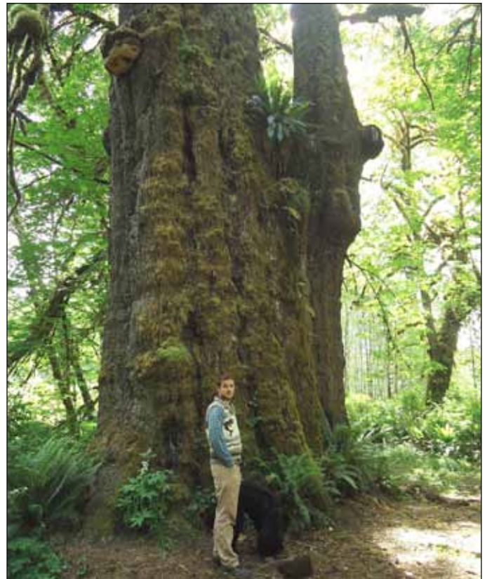
Me and my dog in front of the unprotected San Juan Spruce – Canada's largest Sitka spruce.

Locating and choosing areas worthy of protection is a huge task, and obviously cannot be done from my desk. Part of my job is connecting with allies up and down the Vancouver Island area, often visiting their communities and seeing the wilderness areas that matter most to them. This is by far the best part of my job. I meet local activists whose organization and commitment is surpassed only by their passion for and knowledge of the natural history in their area. By working together with these communities, I hope to raise awareness about just how much wilderness on the Island is still without protection, and encourage people to demand their government leadership take action to conserve our natural history. To list all of the gems that deserve protection on Vancouver Island would take weeks, but here are a few examples that are close to my heart.