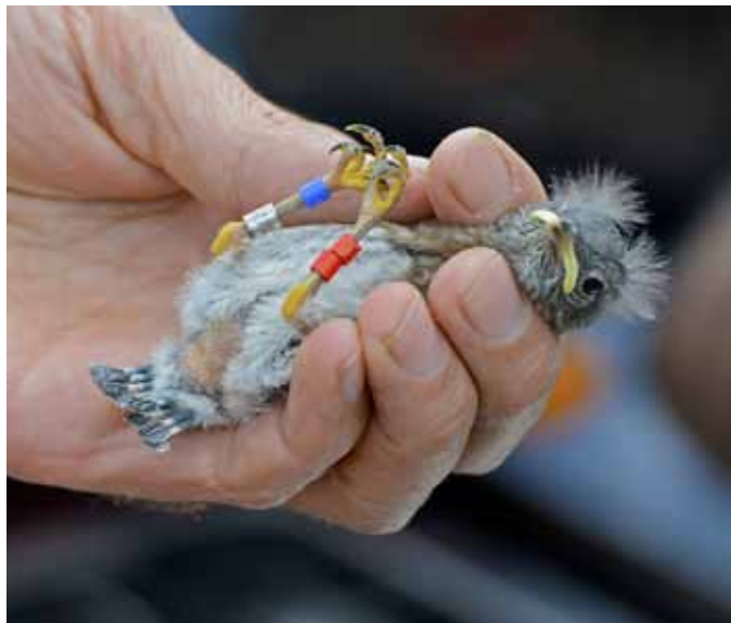
July 22, 2012: Banding day for the first Western Bluebirds to hatch on Vancouver Island since 1995.

July 3–17 So far this month I've been busy monitoring the progress of the family of bluebirds that remained at their