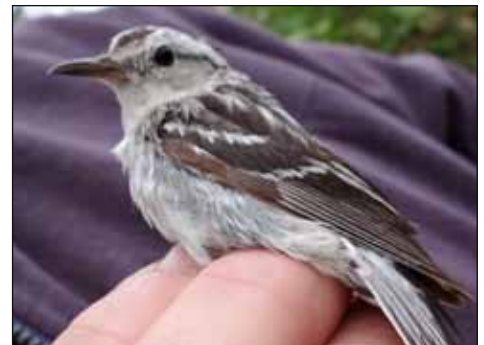
Black-and-white-Warbler: Photo: Ann Nightingale

The Cornell Lab of Ornithology. All About Birds. http://www.allaboutbirds.org/guide/Black-and-white_Warbler/lifehistory Kricher, John C. 1995. Black-and-white Warbler ( Mniotilta varia ). In The Birds of North America Online. A. Poole, ed. Cornell Lab of Ornithology, Ithaca, NY. Retrieved from the Birds of North America Online: http://bna.birds.cornell.edu/bna/species/158