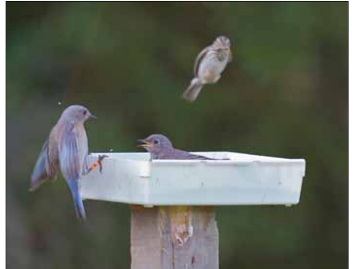
A Song Sparrow comes in to score an easy snack while an adult female and juvenile bluebird feed on mealworms provided by Julia.

release site (the adult pair with the three surviving fledged young and four two-week-old chicks); surveying for the other 11 bluebirds that have been released; installing, monitoring and cleaning out nestboxes that have been installed in the Cowichan Valley; meeting with local landowners that are interested in or already hosting bluebird nestboxes; and collaborating with the Cowichan Tribes First Nation to share knowledge of Western Bluebird ecology and management.