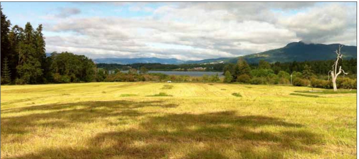
View from the first family’s aviary. They chose a nestbox just outside the aviary for their second (and historic) brood.

My experiences working with this incredibly adaptable and undeniably beautiful species, and the many people who are working to help them, have given me hope that the songbirds will soon return to southwestern B.C. for the long term. In this pilot season, 17 Western Bluebirds (8 adults, 9 juveniles) were captured from Joint Base Lewis-McChord military base in Washington State, which contains one of the largest remaining tracts of Garry oak habitat in northeastern