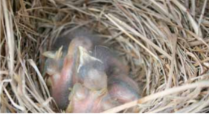
July 13, 2012: I see a glimpse of a blue egg remaining under four pink bodies. Looks like only four of the eggs will hatch.

Washington, and translocated to the Cowichan Valley. At least one of the four translocated adult pairs has produced young here, which is the news of the summer! Our goal is to release at least 90 adult Western Bluebirds in the area by the year 2016. Here are some of the highlights, quirks and things I've learned through my job as the "Bring Back the Bluebirds" Project Technician...so far.