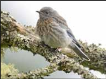
Western Bluebird fledgling perched on a Garry Oak tree at Cowichan Garry Oak Preserve.

June 25 I peeked inside the nestbox and found four beautiful blue eggs that became a clutch of five by June 27th.