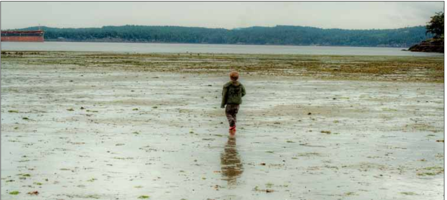
Newcastle Island camping.

HAT and Open Cinema will be hosting a screening of Play Again this November. The film explores the challenges of youth suffering from Nature Deficit Disorder and importance of outdoor play and learning. (We will, however, be hosting the screening indoors!). View the trailer at www.playagain.com , and watch for the announcement from Open Cinema. Hope to see you there!