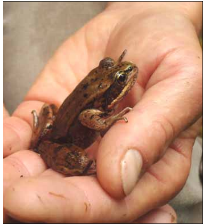
The blue-listed Red-legged Frog in an old-growth stand on Cortes Island.

Another community I've visited for this campaign is Cortes Island – the gateway to Desolation Sound and a truly unique environment. Eight percent of Cortes is owned by corporate logging giant Island Timberlands. The company plans to clear-cut and liquidate their holdings – some of the most ecologically significant land on the island – in the next few decades. In the Island Timberlands parcels on Cortes stand stunning old-growth Douglas-fir, redcedar, Sitka spruce, hemlock, and maple trees, as well as many rare and endangered species like the otherworldly ghost pipe, the majestic Gray Wolf, and even the elusive Northern Flying Squirrel. These forests also contain salmonoid-bearing streams and are