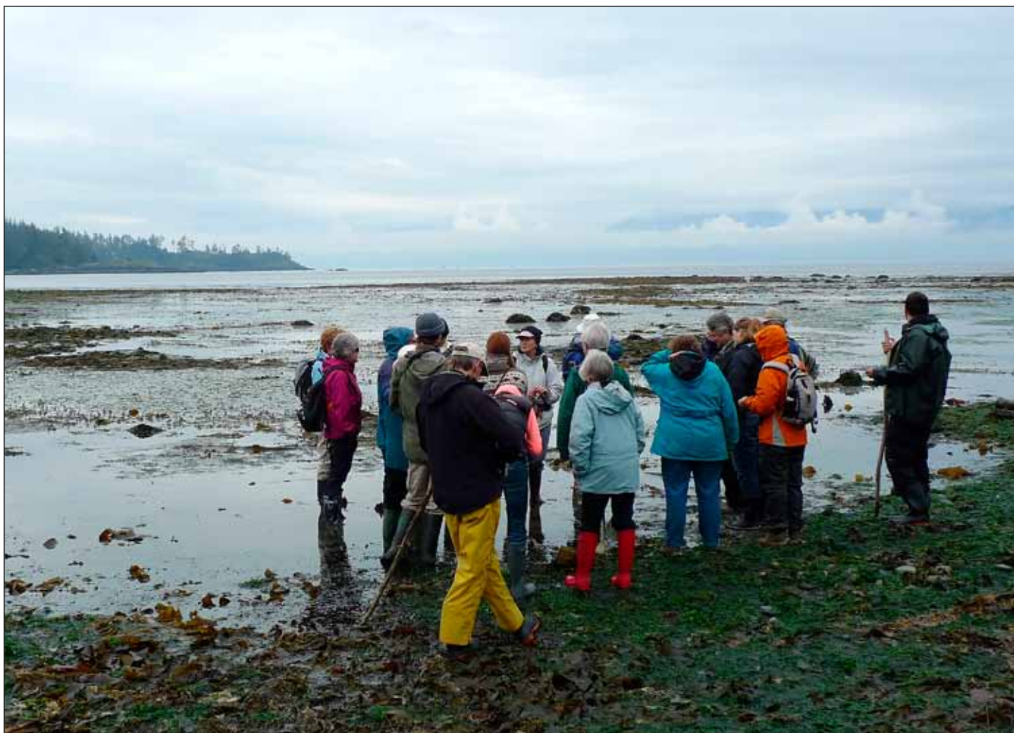
VNHS field trip (21 May 2011) to Whiffen Spit.

The Society currently offers quite a few field trips throughout the year, and 35% of survey respondents attended one in the last two years. This is an area that members feel needs some changes. Some of the survey feedback included suggestions for an increase in both the variety of field trip leaders and the field trip subject matter. Ideas put forward included more geology, archaeology, botanical identification (i.e. tree, moss, fungi), and conservation integration and/or