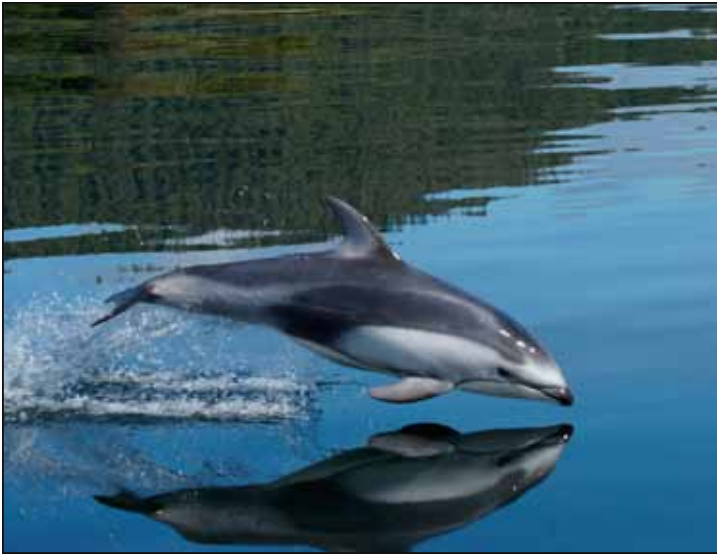
Pacific White-sided Dolphin.