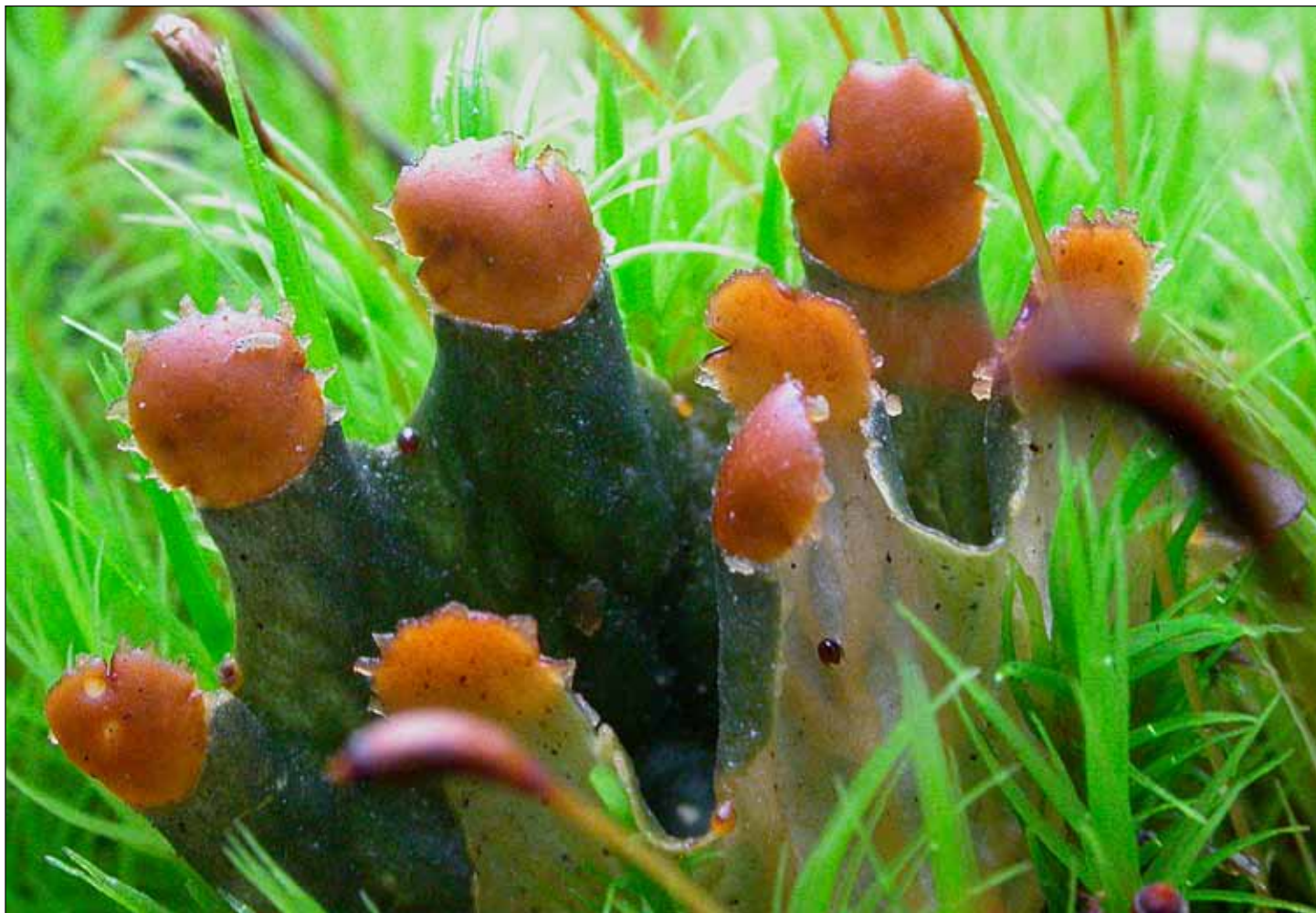
One of the “Pelt” lichens ( Peltigera sp.) – perhaps Freckle Pelt? with fruiting bodies (apothecia) evident (the brown tips).

As a result of the numerous databases we use for mapping, the publications we incorporate and bring online, and the growing dataset we are developing through photo contributions, E-Flora has evolved into a complex and significant botanical resource. Use has increased remarkably, and there is growing use of E-Flora outside of BC. In addition to field botanists, other groups that make regular use of E-Flora include high school and public school classes, as well as university courses (e.g., biosciences, geography, forestry), gardeners, invasive species groups, and the general public.