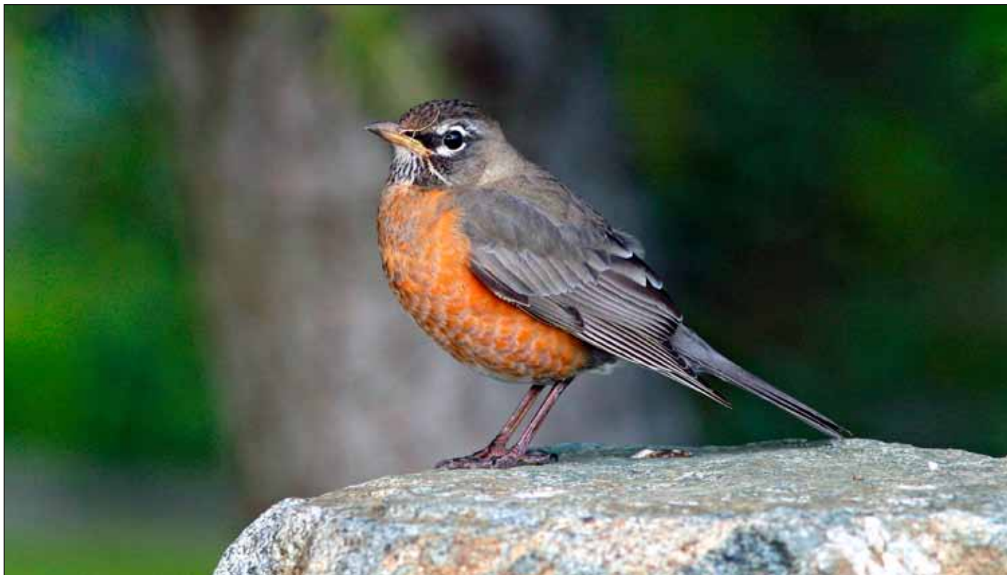
American Robin.