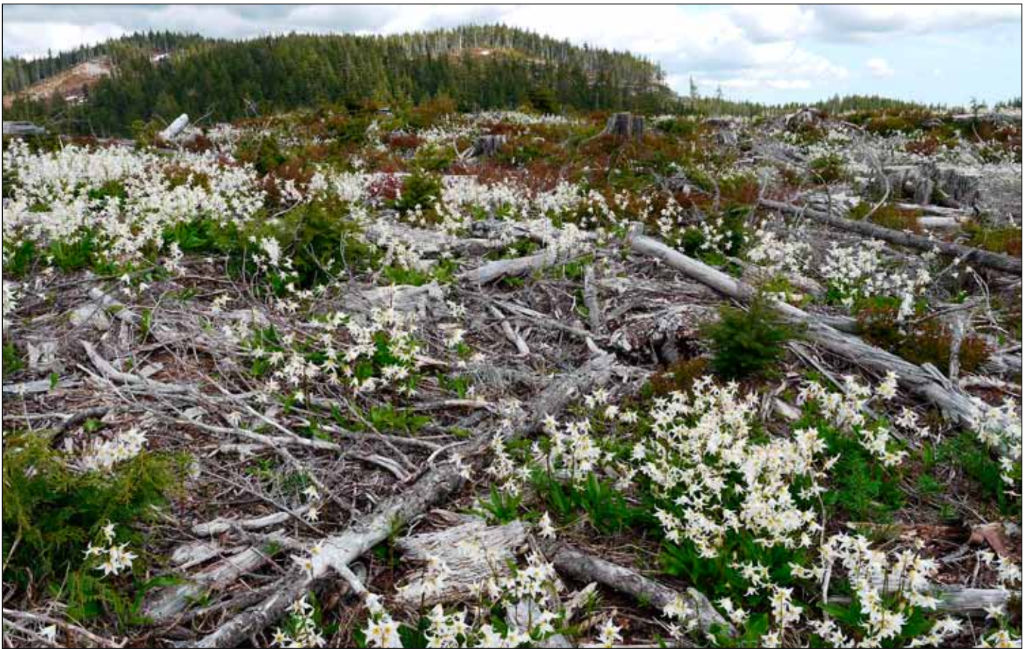
VNHS field trip sighting (June 26, 2011) near the High Jordan Ridge Bogs: A carpet of Avalanche Lily ( Erythronium montanum ).

However, E-Flora BC provides much more than a ‘virtual’ replacement for the eight volumes of the Illustrated Flora of British Columbia . The tremendous power of web-based technology means that web publications like E-Flora can place a wealth of information at your fingertips and can tap into a considerable array of other significant botanical resources. In our case, we tap into several key resources, including records from several major herbaria and, using “deep links”, several major databases of plant information, including the