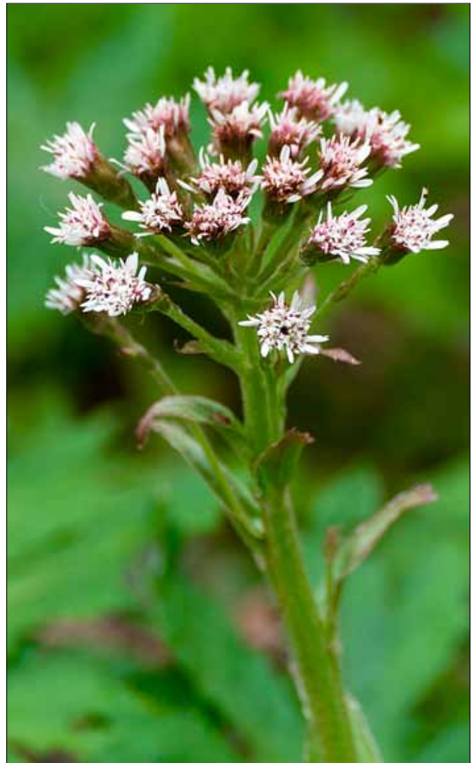
(Top) “Downcast” – Pink Fawn Lily ( Erythronium revolutum ).