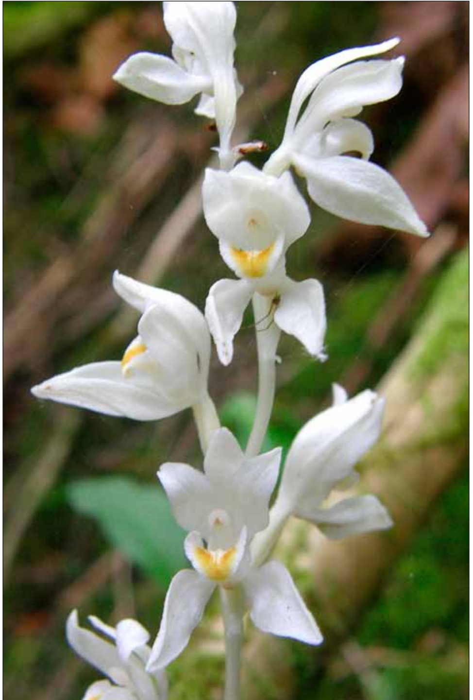
Phantom Orchid, Gowlland Tod Provincial Park.

The rare Phantom Orchid was in full bloom, white and ghostly. The Alaska Rein Orchid was nearly flowering. Many birds sang along our walk,