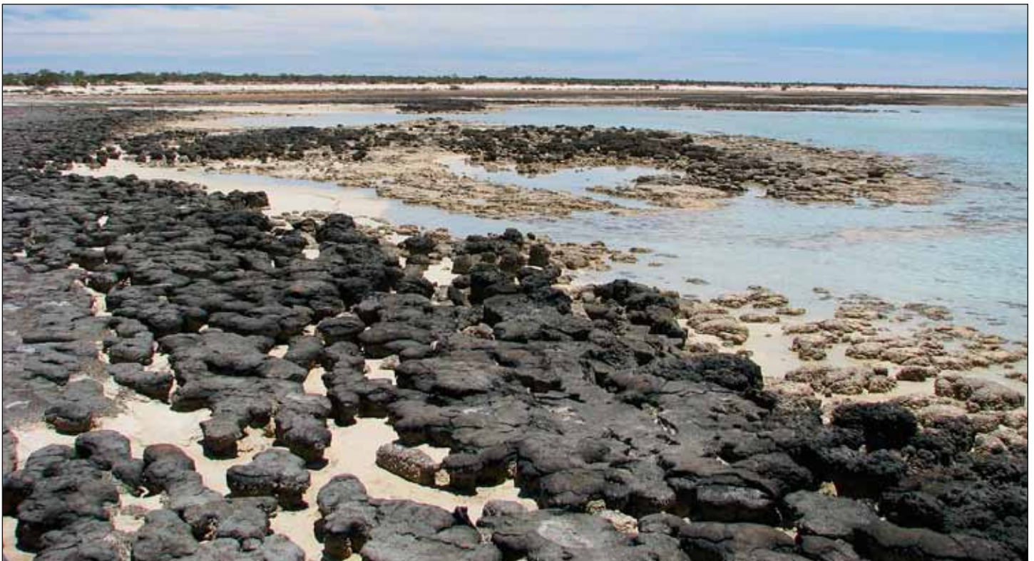
Hamelin Pool, Shark Bay, Australia.

Judging from the well-marked highway signs guiding the way, it became clear I was not entirely alone in my quest to see microbial mats. A short walk from the parking lot we found the 200-metre boardwalk jutting out over the sea. The boardwalk helps shield stromatolites from damage by visitors