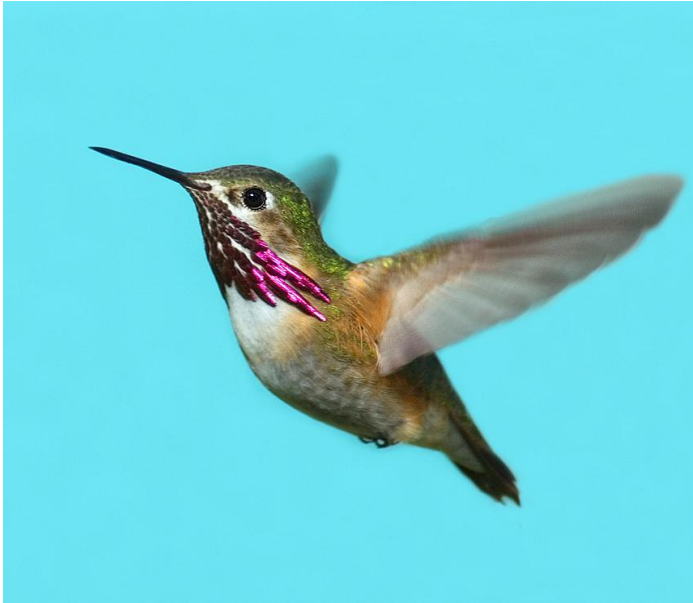
Calliope Hummingbird in Saanich.

One was well described by MR and photographed by TA and TZ at a private residence in Saanich on Apr 23 - 26.