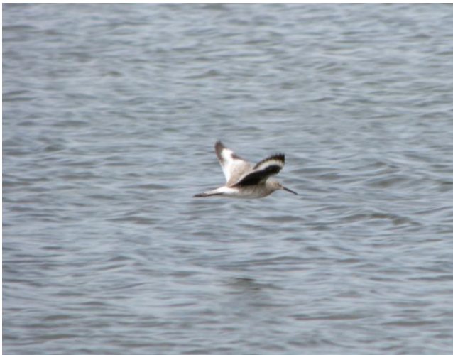
Willet off Whiffen Spit, Sooke.

Other reports of this rare species during the year were not supported by adequate, or any, detail.