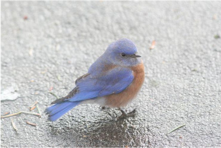
Western Bluebird in Fairfield.