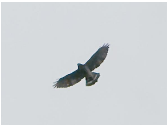
Broad-winged Hawk over Mt McDonald.