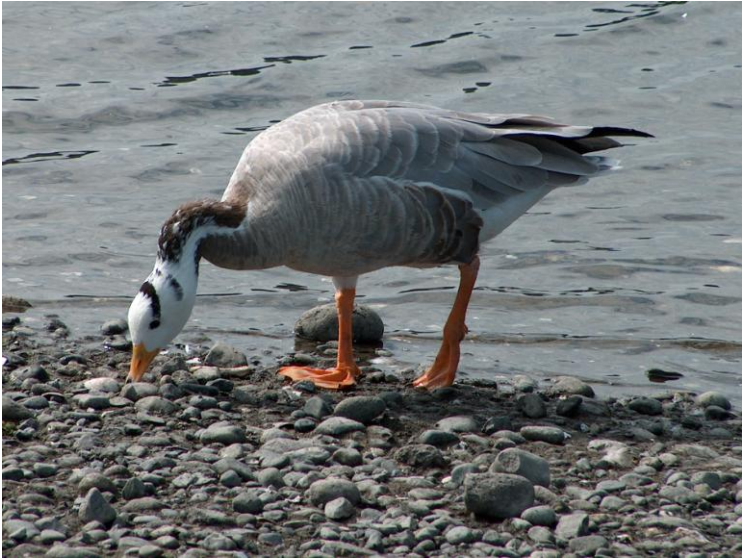
Bar-headed Goose at Esquimalt Lagoon.