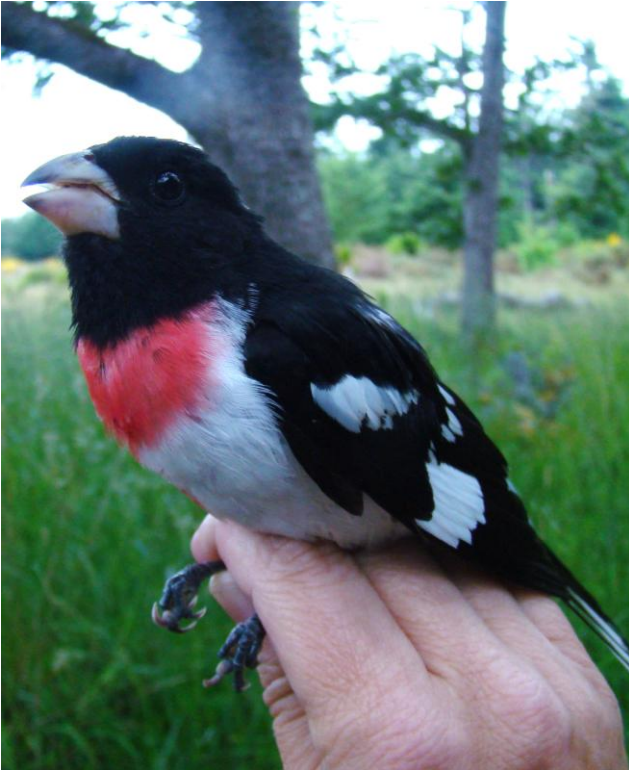
Rose-breasted Grosbeak at Rocky Point.