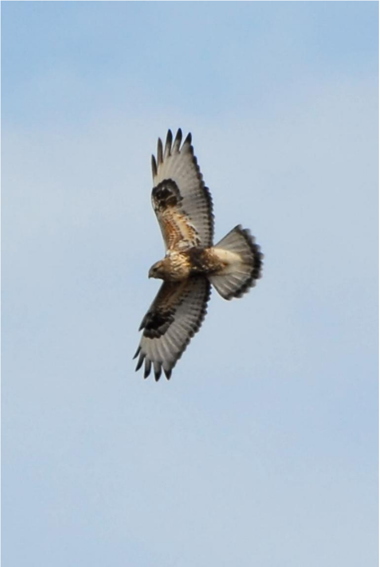
Rough-legged Hawk over Swan Lake – photo by Bruce Whittington